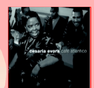
Café Atlantico album cover.

The above CDs are either already available or will be very soon on our online store: