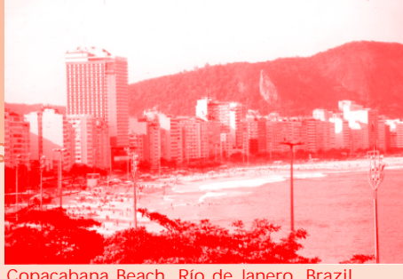
Copacabana Beach, Río de Janero, Brazil

Food: The staples of the Brazilian diet are white rice, black beans and manioc flour, usually combined with steak, chicken or fish. Brazilian specialities include moqueca, a seafood stew flavoured with dende oil and coconut milk; caruru, okra and other vegetables mixed with shrimp, onions and peppers; and feijoada, a bean and meat stew.