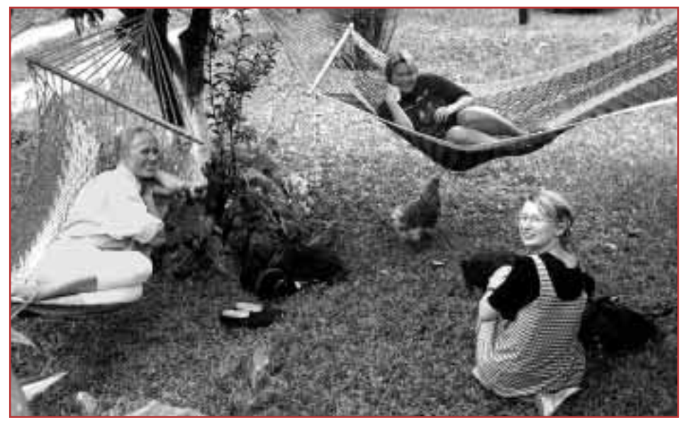
Students lounging between classes.