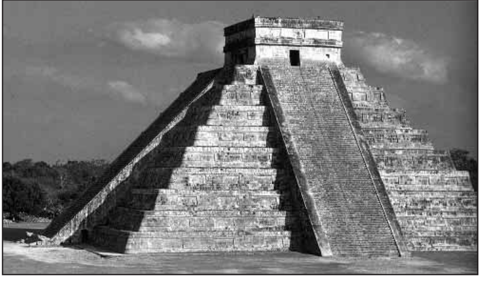
A pyramid at Chichén Itzá in Yucatán, México. See page 3 for info about our Special Program in this region.