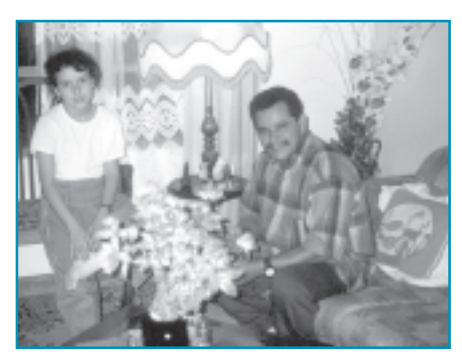
A homestay in Monterverde

The program offers an additional campus in San Joaquín, a suburb of San José, Costa Rica's capital. If you wish, you can switch to this campus after completing at least one week in Monteverde.