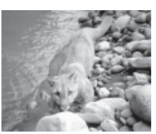
"On the prowl in Bolivia".

The last couple of years we have been receiving an increasing number of requests for a program in Bolivia. To the delight of all of you who have been waiting and waiting, it's finally here! This 1-on-1 program is located in Cochabamba, the third largest city in