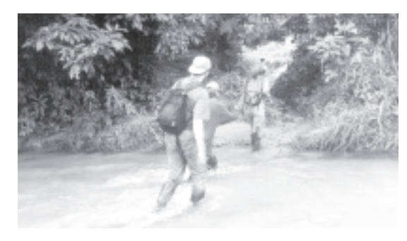
A jungle walk in Bolivia

small town feel. The area reflects the diversity and contrast of its country. Colonial villages, traditional communities and pre-Colombian archeological sites are within reach.