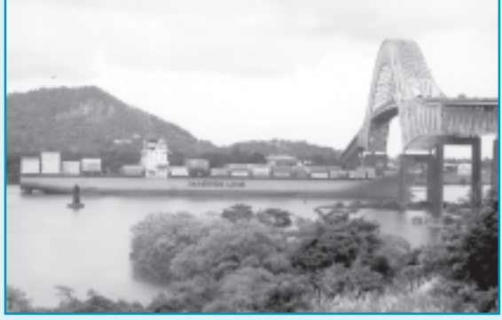
The Panamá Canal

The Panama Country Close-up is as of March 1999 and provided by The Latin American Travel Advisors. For additional details, PO Box 17-17-908, Quito, Ecuador. USA & Canada toll-free fax: (888)215-9511. International Fax: +593-2-562-566. Email: lata@ecnet.ec Web: www.amerispan.com/lata/