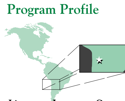
Linguatec Language Center Santiago, Chile