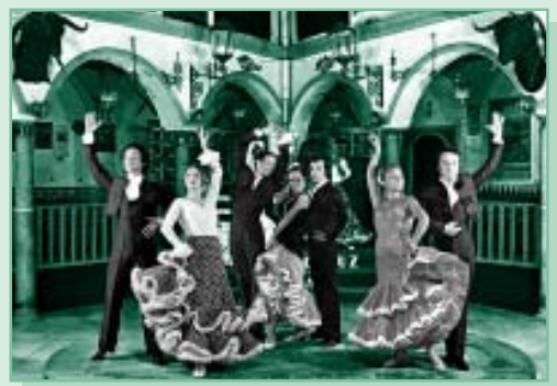
Seductive elegance of the Flamenco.

The don Quijote program in Málaga, shares a common philosophy and teaching methodology with all don Quijote programs. The school is just 300 meters from the beach and situated at the center of the "Pedregalejo" district. The building has six classrooms with a central courtyard, a covered terrace and a recreation room.