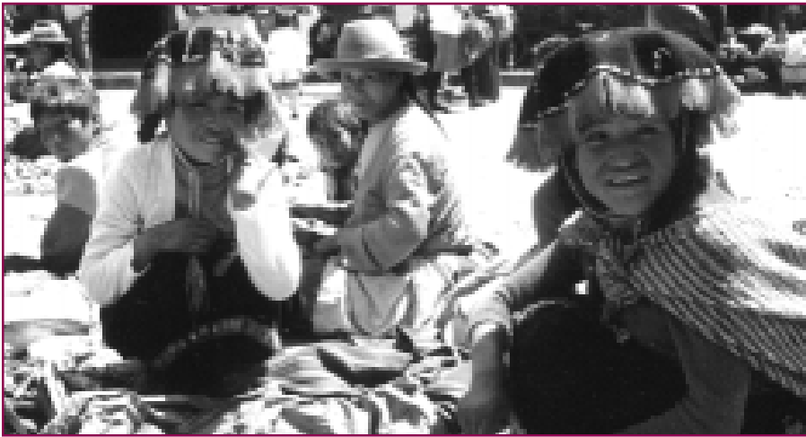
Colorful, warm and creative indigenous people of Perú