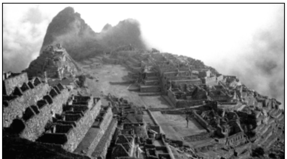
Machu Picchu, Perú - the lost city of the Incas.

Latin American Travel Consultants Box 17-17-908 Quito, Ecuador Fax: 593-2-562-566 E-mail: lata@pi.pro.ec WWW: http://www.amerispan.com/latc